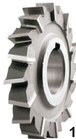
1212 DIN 885 A-H dentes cruzados, alternados ângulo de hélice ~ 8°