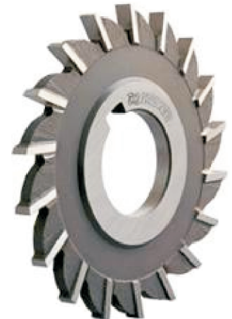
1202 DIN 885 B-H dentes retos