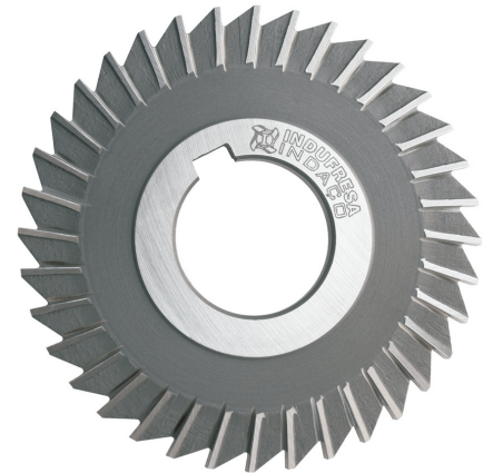
1203 DIN 1834 B-N dentes retos