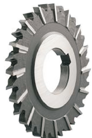
1213 DIN 1834 A-N dentes cruzados, alternados ângulo de helice ~ 14°

Fresa circular, corte 3 lados e dentado extra fino.